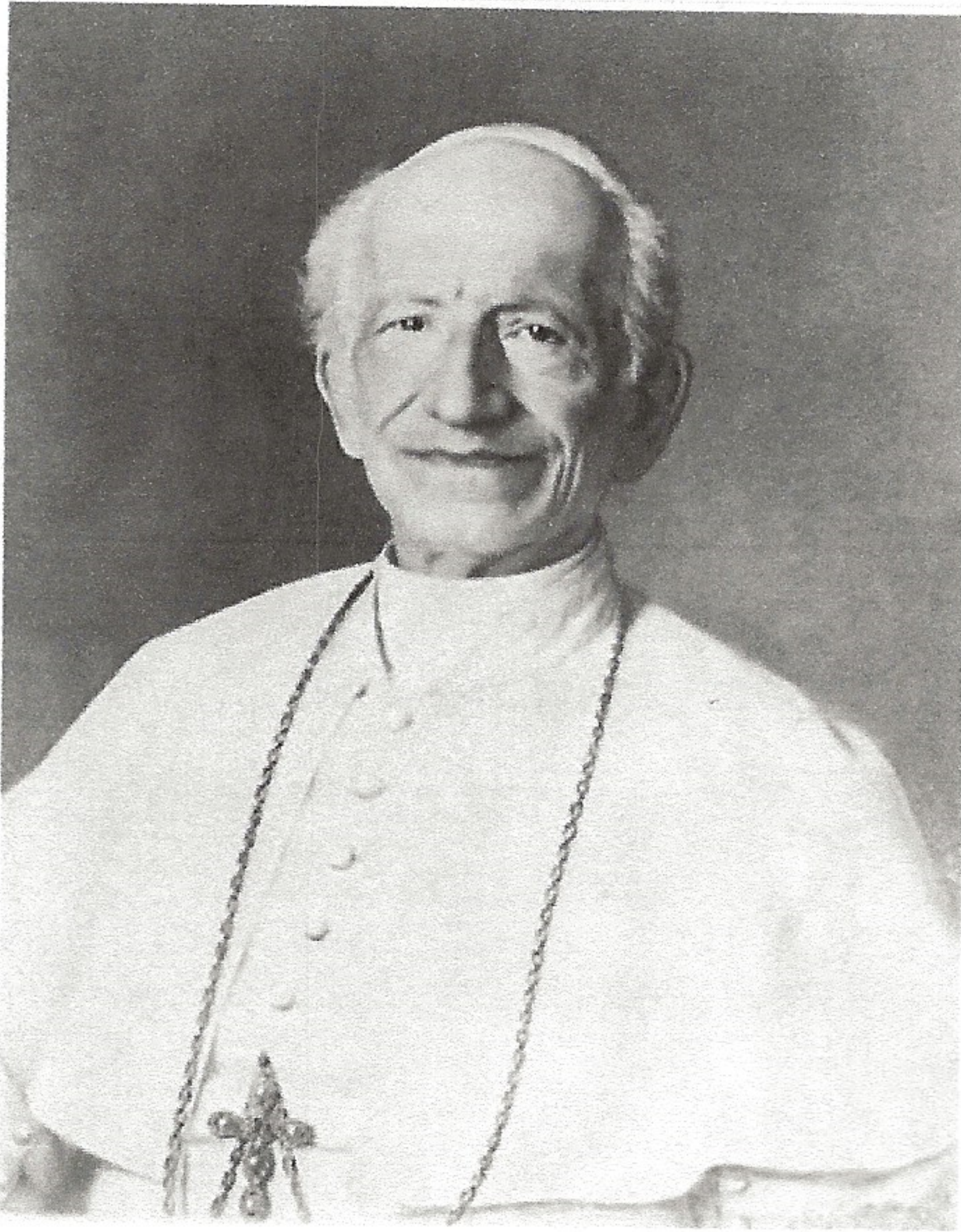
Official photograph, 1898 [a]